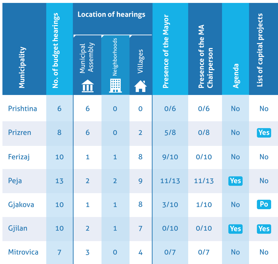
Table 1. Budget hearings for the 2019 budget